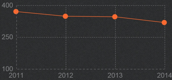
Teen STD rates are going down